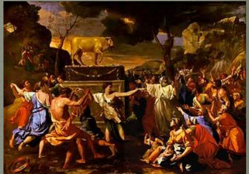
Nicolas Poussin, "Adoration of the Golden Calf."